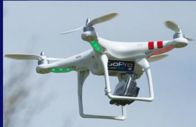
Industrial Facilities Diagnosis using Non Destructive Tests . (Visual, Thermographic, Ultrasonic, Drones , others).