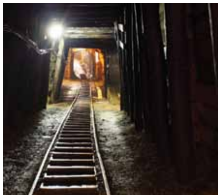
| iCAM501 Ultra has ATEX & IECEx M1 mining approval