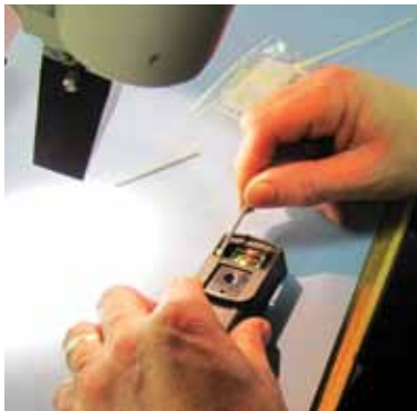
| iCAM501 Assembly in the Extronics Vision Lab

Over the past five years Extronics has made substantial investment in R & D, technical skills and production equipment to create a range of vision solutions that deliver real value to customers.