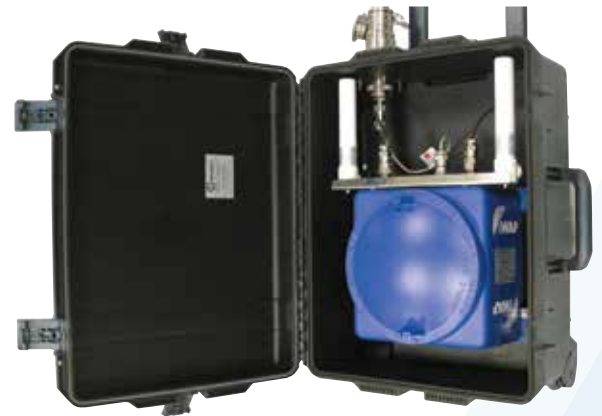
ABOVE: iWAP Mobile – Zone 1 Portable Access Point

Each iWAP Enclosure is supplied with all the required internal power supplies, cable routing, fixtures and fittings to suit the specific vendors Access Point or